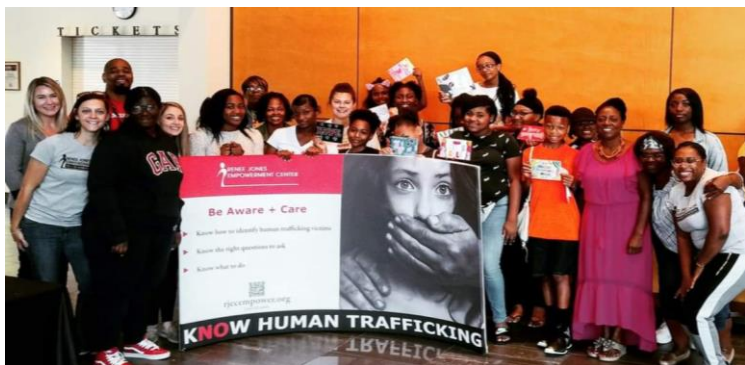
Renee Jones Empowerment Teen Summit conference planned and implemented by the youth ambassadors for teen awareness.

To learn more, visit www.rjecempower.org or on Facebook (Renee Jones Empowerment Center) to see upcoming events and more.